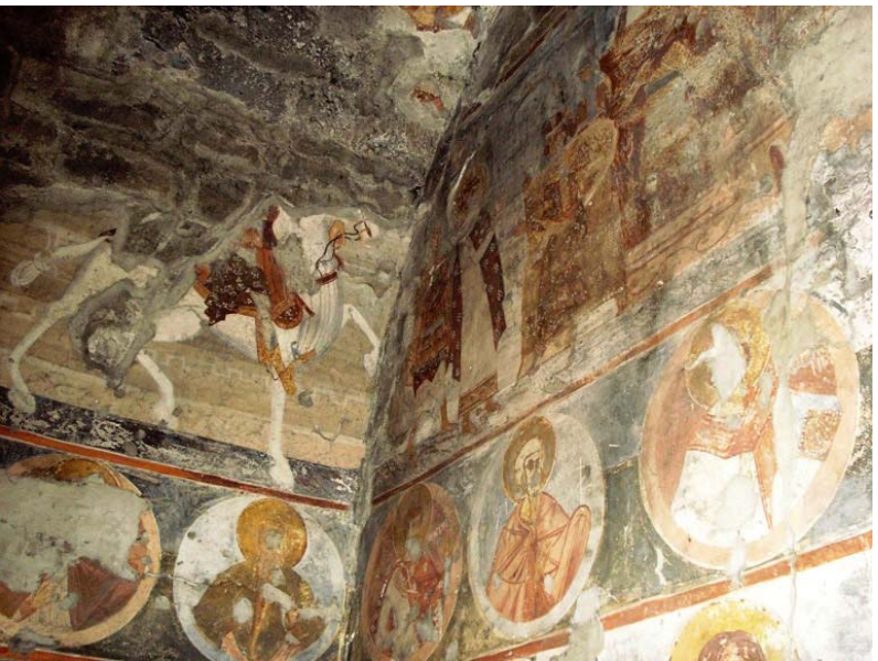
Image 1 Fresco painting in church dedicated to Saint George, Monastery Ajdanovac.