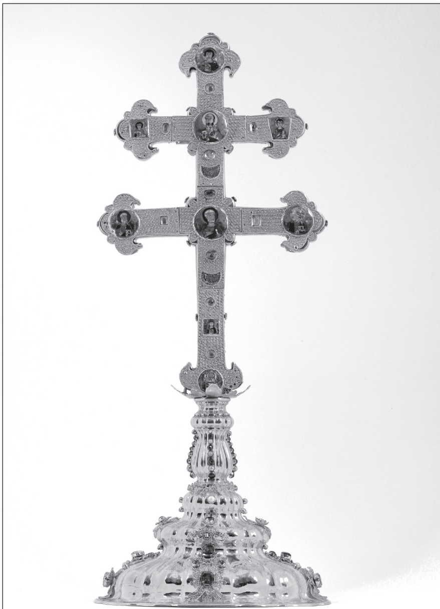
Záviš's cross (back side), Cistercian Abbey Vyšší Brod