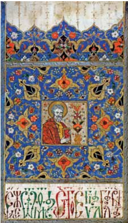
6. Matthew the Evangelist, The Four Gospels of Karan , Treasury of the Nikolje Monastery, fol. 6