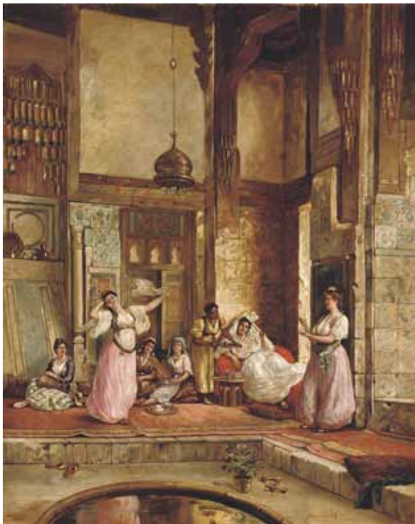
3. Paja Jovanović: In the harem , oil on canvas, 76x61 cm, private collection