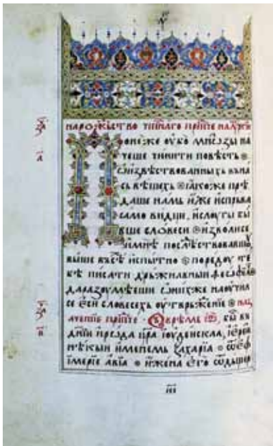
8. Headpiece, The Four Gospels of Karan , Treasury of the Nikolje Monastery, fol. 145