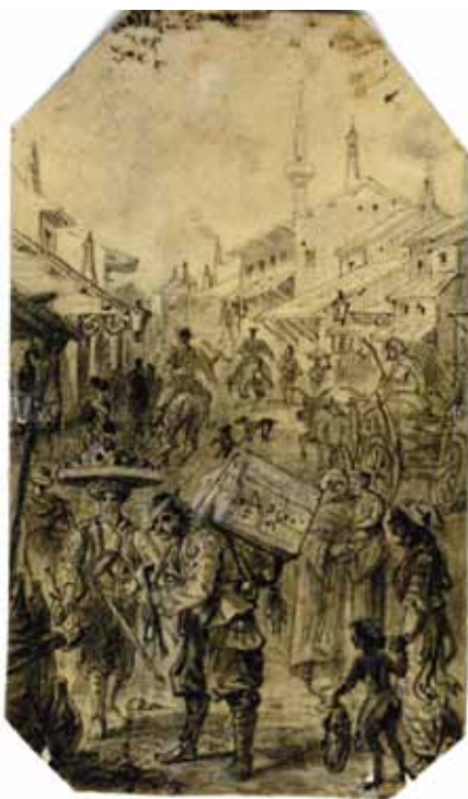
2. Felix Kanitz, "Turkish Market Street (Turkische Bazarstrasse)", Archive SANU , 7901-II-003