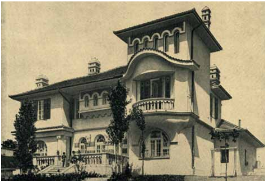
5. Čedomir Glišić, Villa in Tolstojeva Street, Belgrade (Belgrade municipal newspaper for December 1932)