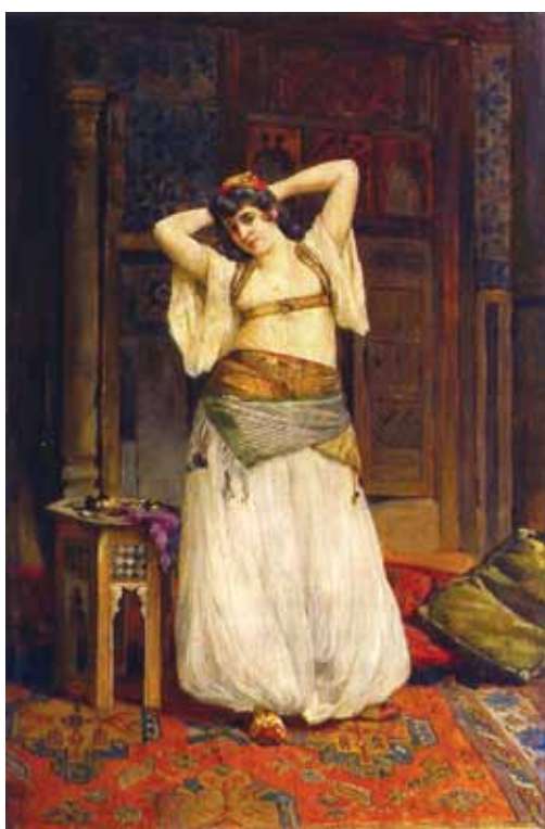
2. Paja Jovanović: Woman in the oriental dress , mid 1880s, oil on board, 36x24, National Museum in Belgrade