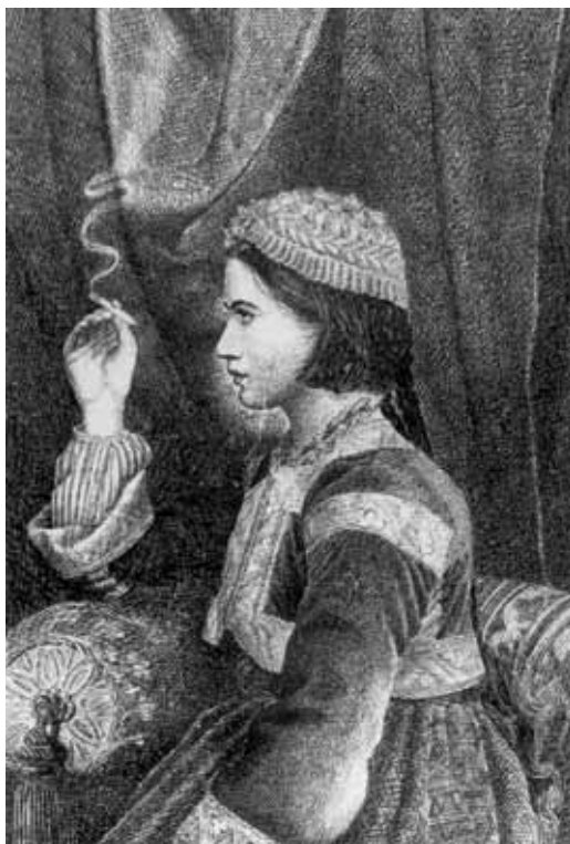
7. Vladislav Titelbah: Mohammedan Woman from Niš , reproduction in Sprške ilustrovane novine , No.27, Yr II (Novi Sad, August 15, 1882)