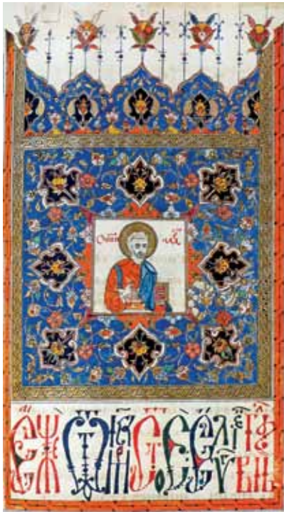
7. Mark the Evangelist, The Four Gospels of Karan , Treasury of the Nikolje Monastery, fol. 89