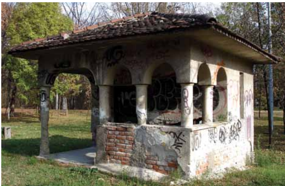
6. Tram station in Topčider, Belgrade (author V. Putnik)