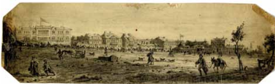
3. Felix Kanitz, “Velika pijaca (Great Market) in Belgrade”, Archive SANU , 7901-II-005