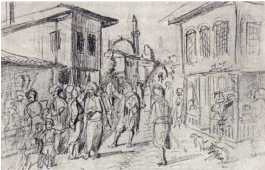
1. Anastas Jovanović, "Belgrade in 1846., at Dortjol"