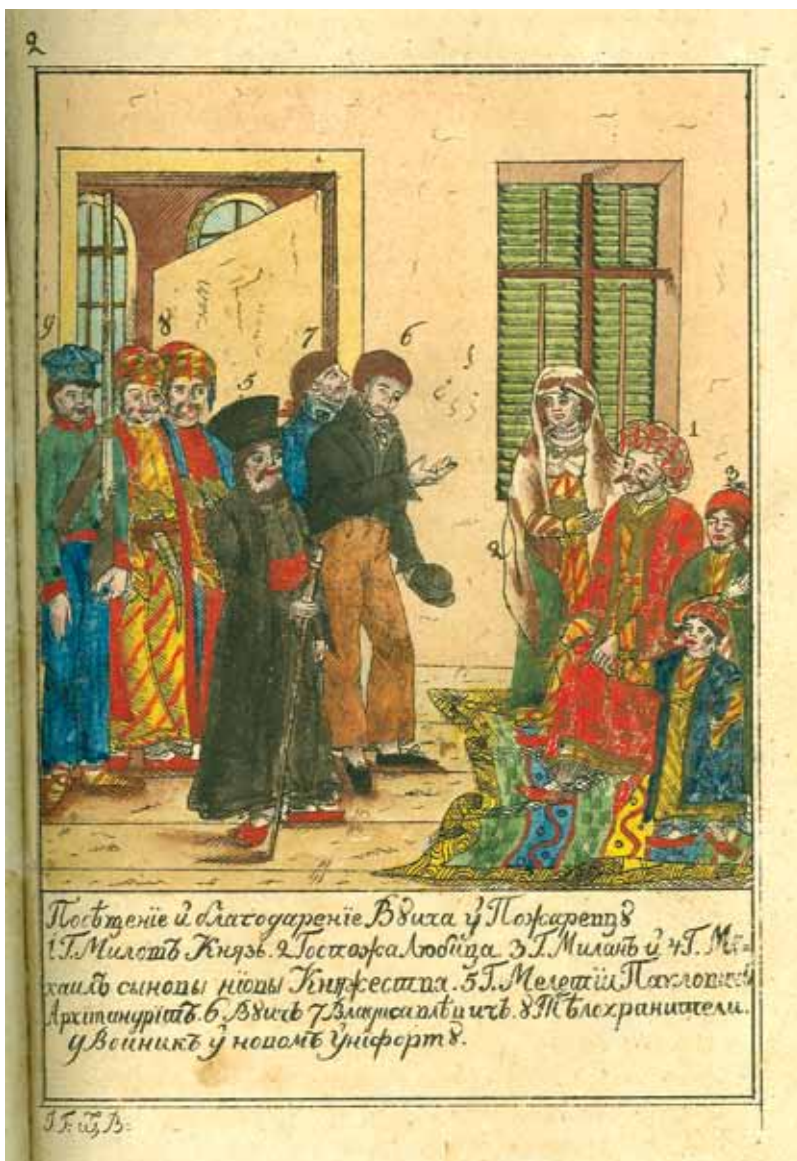
5. Joakim Vujić, "Prince Miloš Obrenović in Požarevac", Putešestvije po Srbiji , 1828