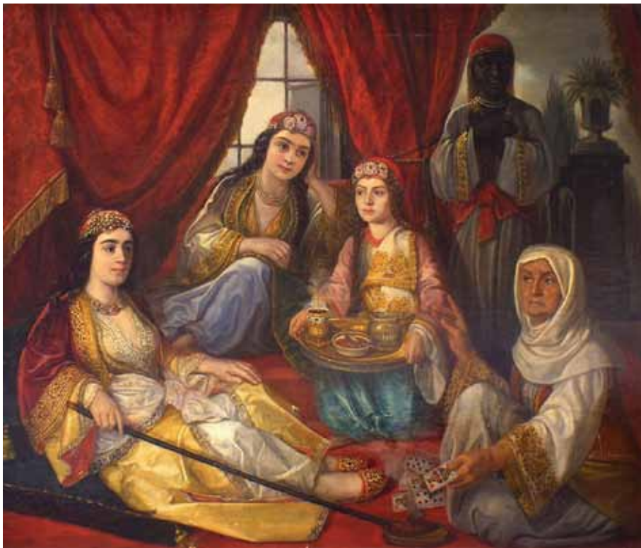
5. Katarina Ivanović: Fortune-telling , 1865-70, oil on canvas, 75x89 cm, National Museum in Belgrade