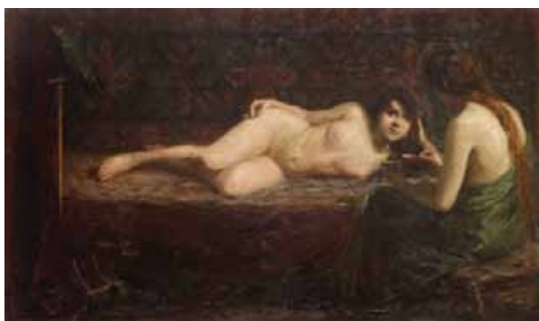
6. Beta Vukanović: After the bath (fortune-telling) , 1906, oil on canvas, 105x176 cm, National Museum in Belgrade