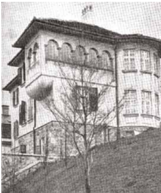
4. Villa in Milovan Glišić Street, Belgrade (Belgrade municipal newspaper for December 1932)